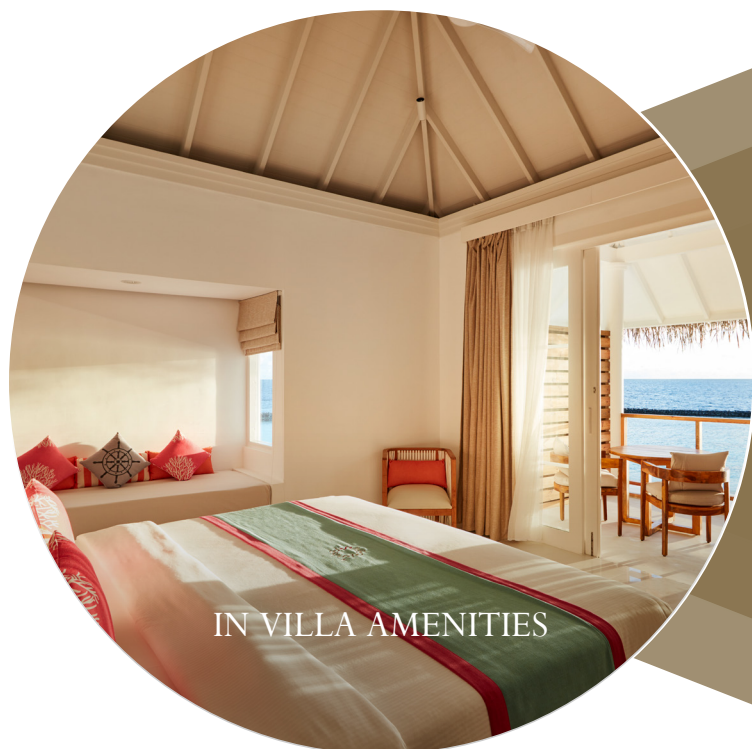
IN VILLA AMENITIES